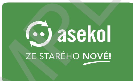
(3) inverse form